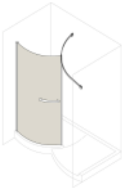
Space I (left hand shown)