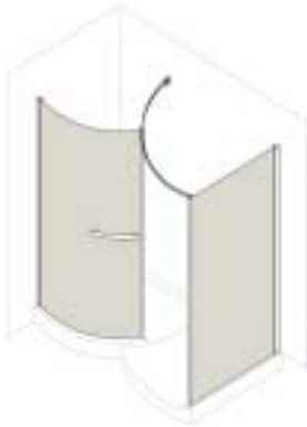
Space II (Left hand shown)